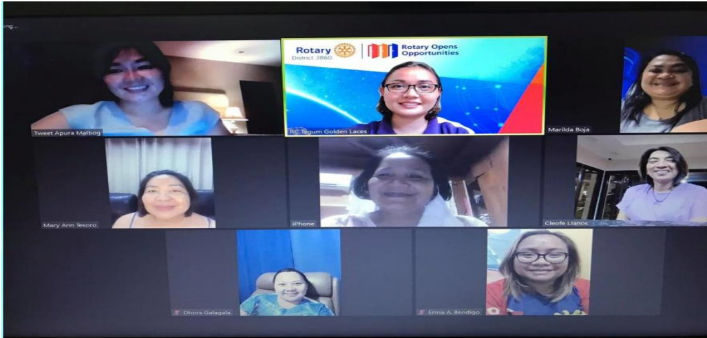
BOD Meeting 21 April 2021