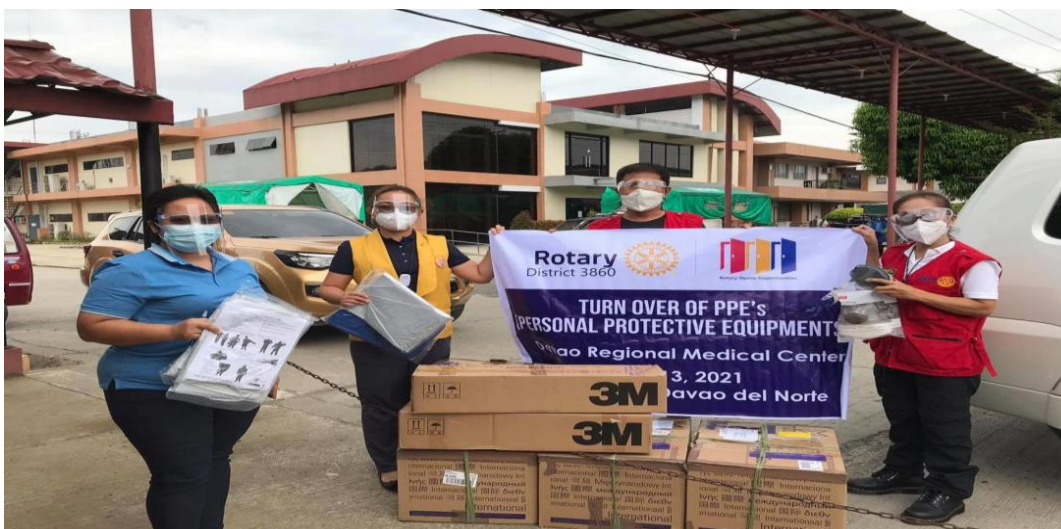
Turn-over of PPEs at Davao Regional Medical Center 19 April 2021