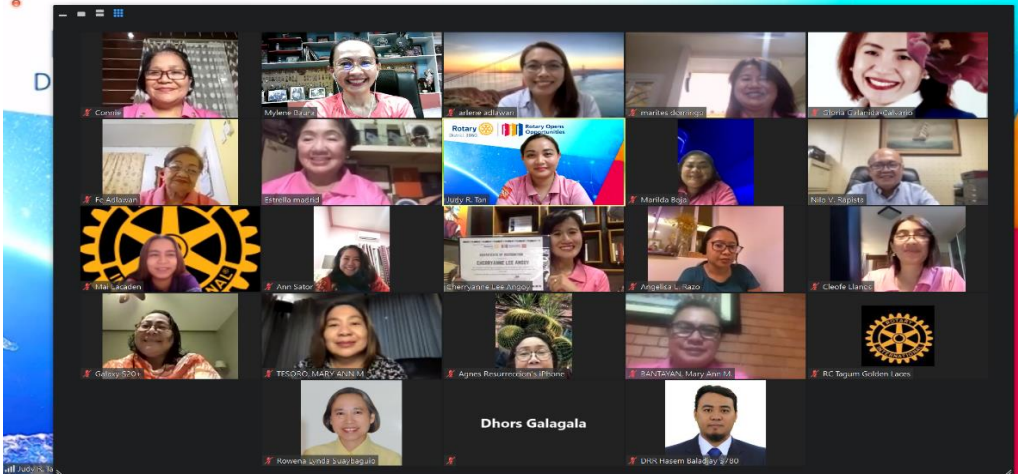
17th Virtual Meeting 14 April 2021