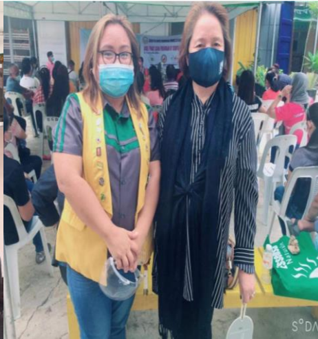
Agri-Pinay Loan Program Orientation 16 April 2021