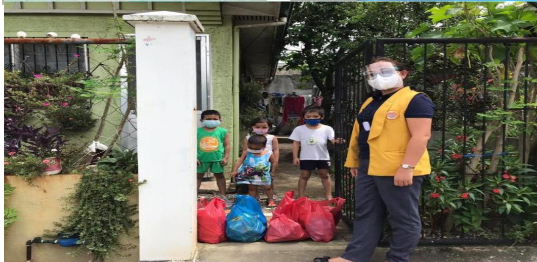
Delivery of food items to House of Hope 19 April 2021